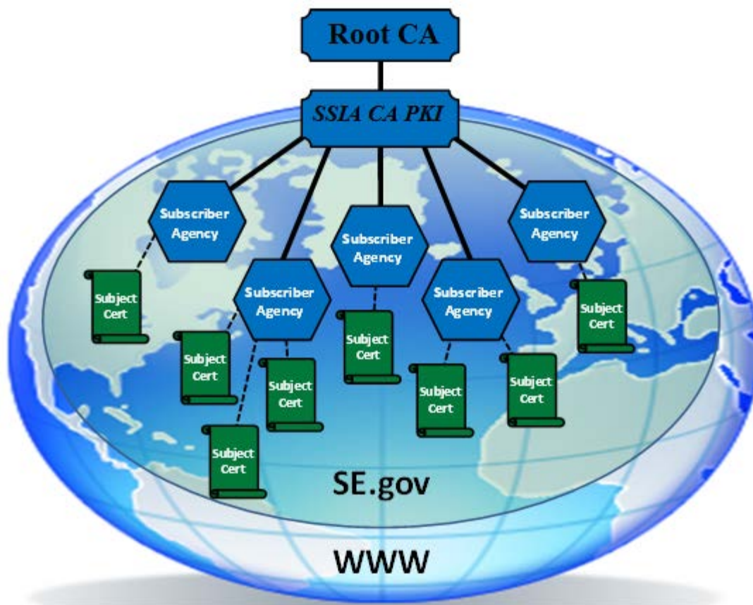
Figure 1 - Scope and Domain of the SSIA PKI