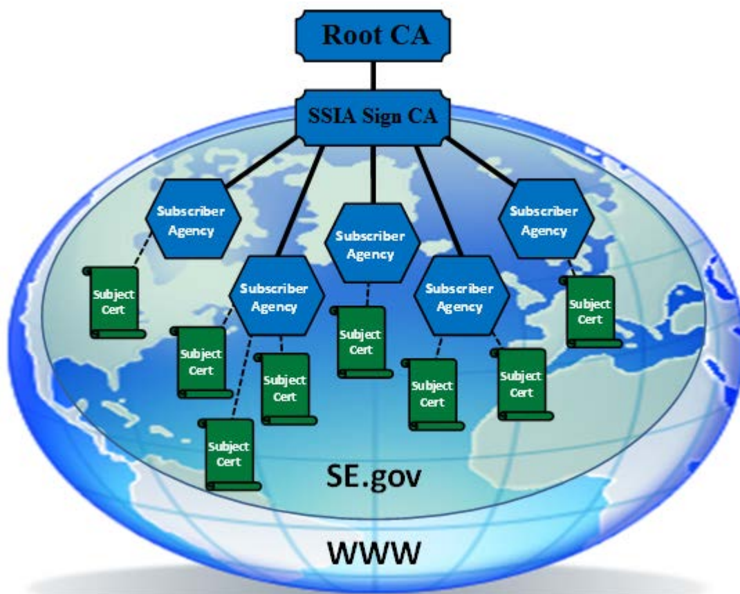
Figure 1 - Scope and Domain of the SSIA PKI

This CP covers SSIA's SIGN Public Key Infrastructure (SSIA SIGN PKI) which issues Signing Certificates to SSIA subscribers (Swedish government agencies). Figure 1 offers a schematic representation of the SSIA SIGNPKI and its relationship to its subscribers.