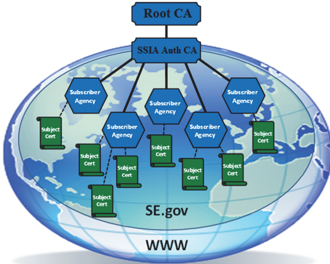
Figure 1 - Scope and Domain of the SSIA AUTHPKI

This CP covers Försäkringskassan's AUTH Public Key Infrastructure (SSIA AUTHPKI) which issues Authentication Certificates to SSIA subscribers (Swedish government agencies). Figure 1 offers a schematic representation of the SSIA AUTHPKI and its relationship to its subscribers.