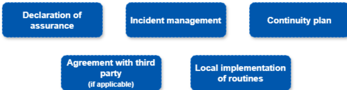
Figure 1 – EFOS PKI document structure

Certificates issued pursuant to this CP are intended for use within the Swedish Public Sector. This includes the subcontracted service providers and subcontracted personnel within each issuance domain, hereafter assumed to be included within any reference to the Swedish Public Sector.